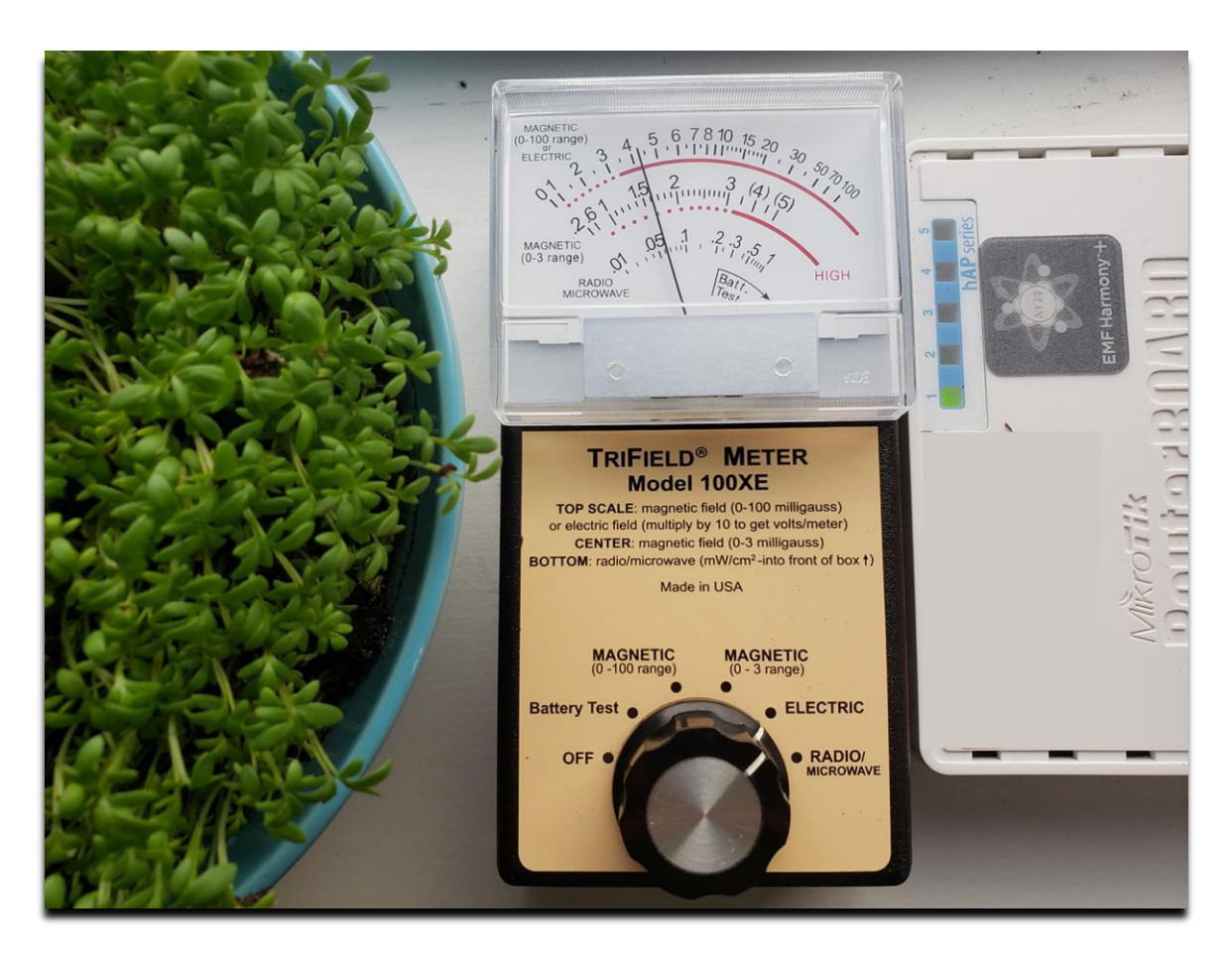
Electric EMF Readings for Bowl A