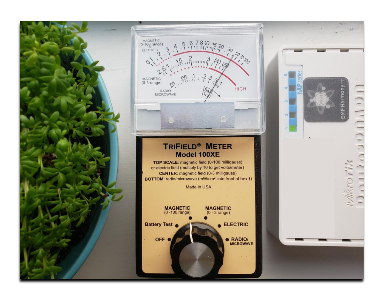
Magnetic EMF Readings for Bowl A

EMF Conditions Bowl A – Above are images showing the EMF readings for Bowl A, which was grown next to the WiFi router where the TriField meter is placed. Both the electric (appx 45 volts/meter) and the magnetic (appx 40 milligauss) readings are in the red zone, indicating a strong presence of electromagnetic radiation.