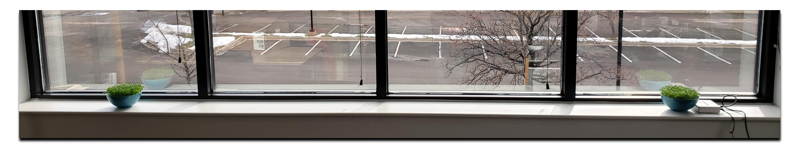
Growing Conditions of Bowl A (right) and Bowl B (left)

Growing Conditions – Above is an image showing the environment in which the test was conducted. Bowl A on the right has the WiFi router next to it. Bowl B on the left is 8 feet away with no EMF emitting devices present.