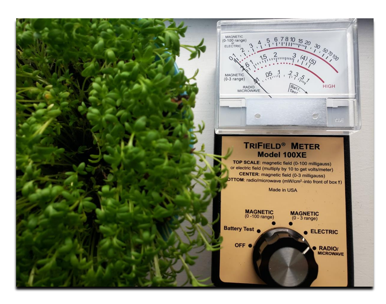
Electric EMF Readings for Bowl B