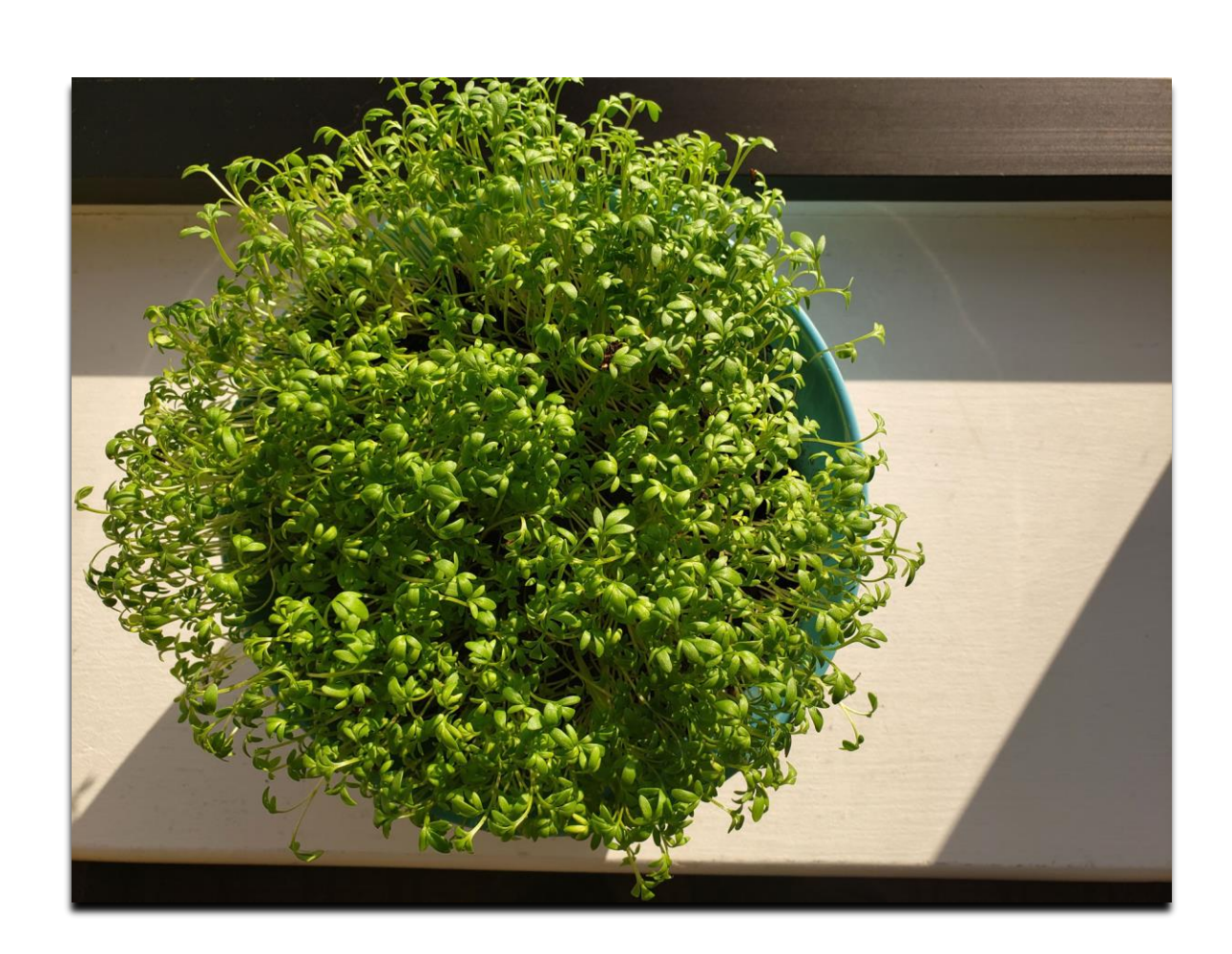
Phase 2, Bowl B

Results of Phase 2 – Above are images showing the growth of the sprouts after 10 days. On the left is Bowl A, next to the WiFi router with the EMF Harmonizer+ attached to it. On the right is Bowl B, the control with no EMF's present. There is no noticeable difference in the health of the sprouts.