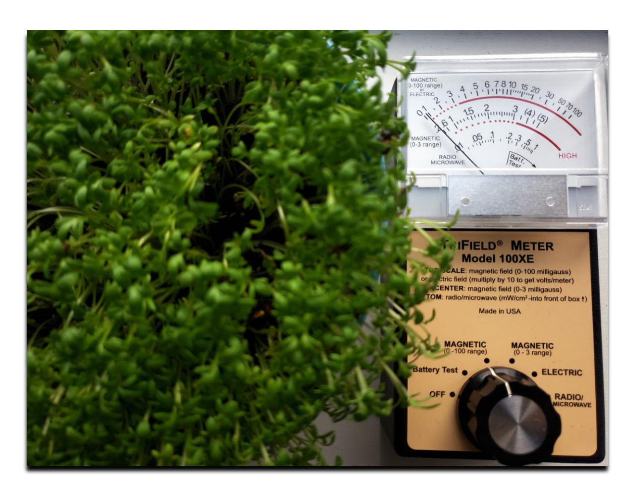
Magnetic EMF Readings for Bowl B

EMF Conditions Bowl B – Above are images showing the EMF readings for Bowl B, the control that was 8 feet from Bowl A. Both the electric and the magnetic readings indicate no significant presence of electromagnetic radiation.