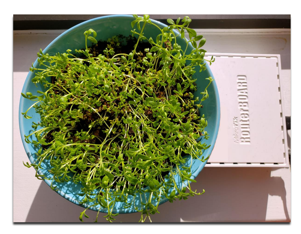
Phase 1, Bowl A