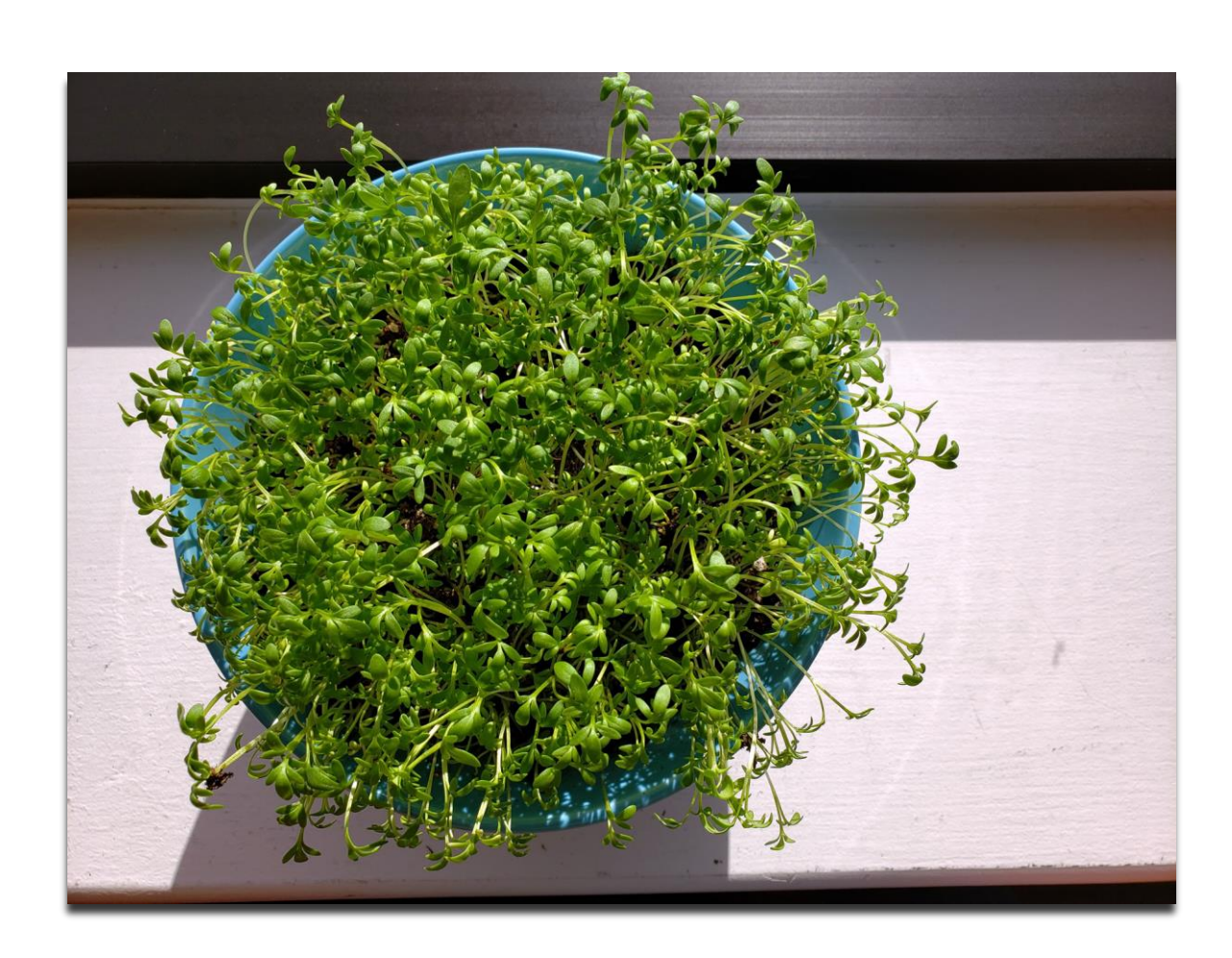
Phase 1, Bowl B

Results of Phase 1 – Above are images showing the growth of the sprouts after 10 days. On the left is Bowl A, next to the WiFi router with no EMF protection attached to it. On the right is Bowl B, the control with no EMF's present. The sprouts in Bowl B are noticeably healthier than those in Bowl A.