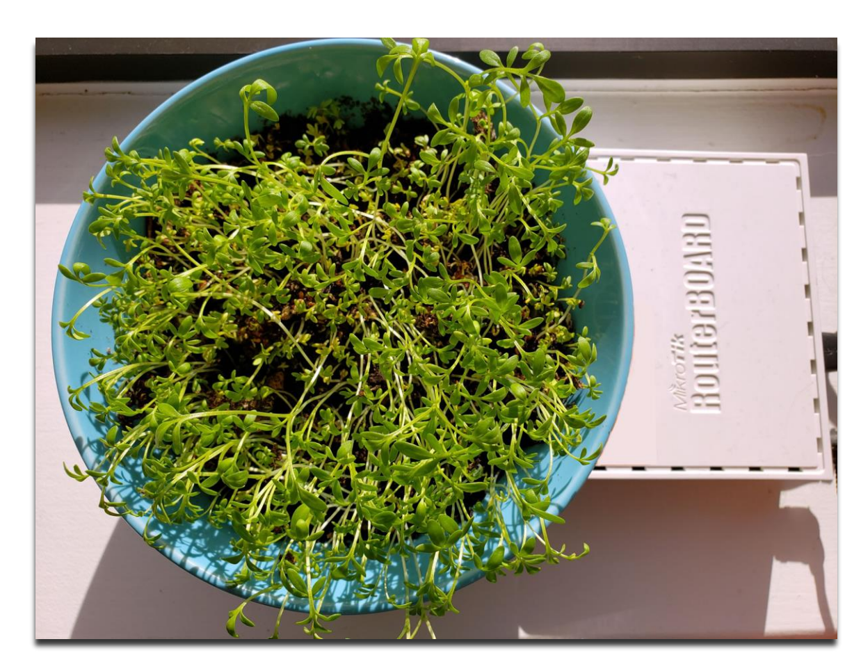
No EMF Protection on WiFi Router