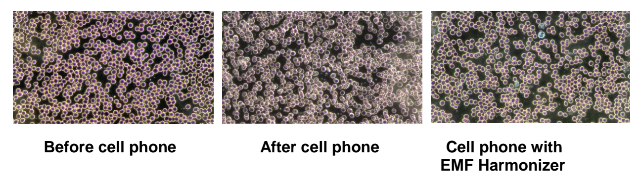
Figure 1. Results of cell phone use with and without the Harmonizer+ from the first subject.

Description from left: In normal circumstances (before cell phone use), the red blood cells move around freely (left image). After five minutes of talking on an iPhone 8 Plus, the RBCs are aggregating, or clumping and rouleaux formation has begun (middle image). The right image shows blood after using the phone for another five minutes with the Harmonizer+ attached to the phone.